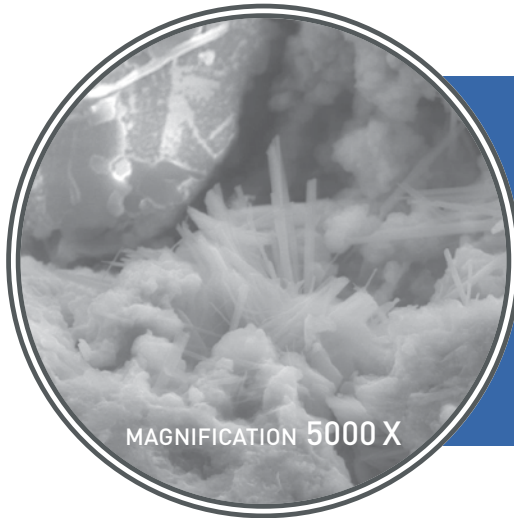
MAGNIFICATION 5000 X

The active ingredients in PENETRON ADMIX react in a catalytic reaction with moisture in fresh concrete and by-products of cement hydration. This chemical reaction generates a non-soluble crystalline formation throughout the pores and capillary tracts of the concrete that permanently seals microcracks, pores and capillaries against the penetration of water or liquids from any direction. This protects concrete from deterioration, even under harsh environmental conditions.